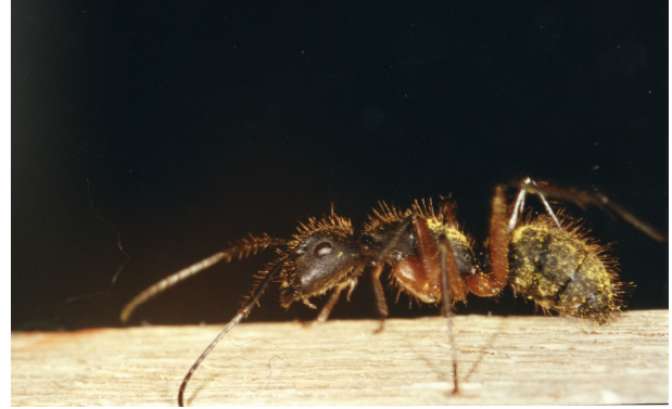
FIGURE 1: Worker of the nectar-feeding ant Camponotus rufipes , walking on a wooden stick to collect sugar solution from an artificial feeder. The ant was marked with yellow powder to allow for individual recognition.

Many social insects will collect and store food, when available, for times of resource dearth. Ant colonies of C. rufipes differ from other social insects such as honeybees, in that they store nectar internally in workers' crops. This