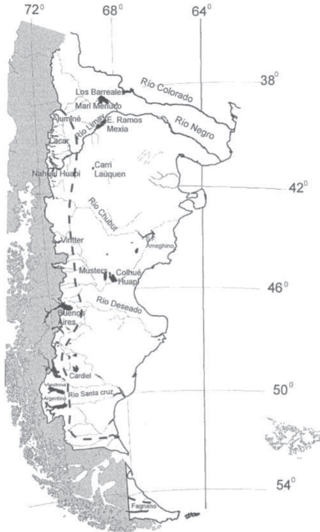
Figure 1. Hydrological map of Patagonia. Dashed line shows the limit between Glacial lakes of the Southern Cordillera and Patagonian closed depressions (from Iriondo 1989 and Drago and Quirós 1996).

fractions (for an extensive revision of experimental evidences see Modenutti et al. 1998 and references therein).